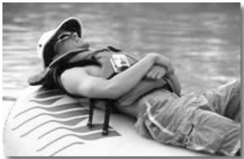
An experienced boatman recovering after a hard day.

By the time our Explorers graduate from high school they have become seasoned “boatmen”. Many of the Post Alumni over its ~ 50 years of existence have gone on to work as professional river guides, Outward Bound Instructors, and even had first descents credited to them all because of the skills and knowledge they obtained while being a part of Explorer Post 20.